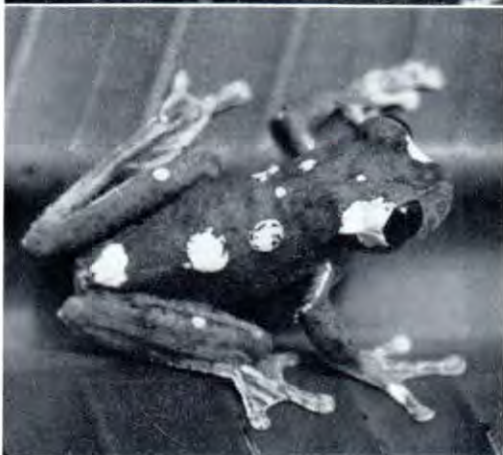
Gekko vittatus (above), a large gecko occurring in many parts of Papua and New Guinea. It is often found at the bases of leaves of coconut, pandanus and sago palms. Nyctimystes kubori (below) is a tree frog common in some parts of the New Guinea highlands.

Pass visit. On returning to Port Moresby some of them were kept alive under refrigeration, and were subsequently returned to the Museum in the cold room of a coastal steamer for further study.