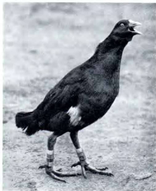
A Native Hen in the "challenge" position giving its territorial defence call.

Usually the intruder leaves before it comes to a fight, or soon after it has begun.