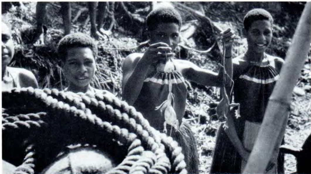
Children offering frogs for sale at a village on the Aramia River, Papua. Children were found to be the best collectors of the small lizards and frogs which were being sought on this expedition.

From Lake Murray I returned to Port Moresby, and then flew by commercial and charter aircraft via Lae and Madang to Simbai Patrol Post in the Schrader Mountains. From there it was only a few hours' walk to the village of Fungoi, situated at about 5,500 feet in the beautiful Kaironk Valley, between the Bismarck and Schrader Ranges. Here, as everywhere else in New