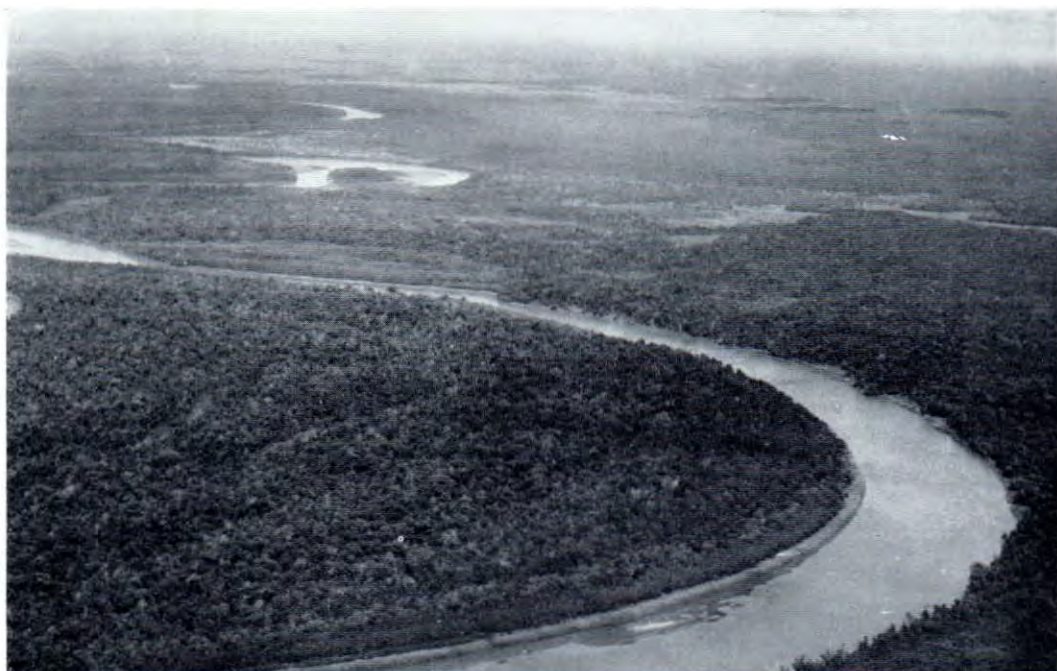
Aerial view of the Strickland River in western Papua, showing the mud-banks on which the Pitted-shelled Turtle, Carettochelys , lays its eggs. This photo also shows the nature of the Western District lowlands.