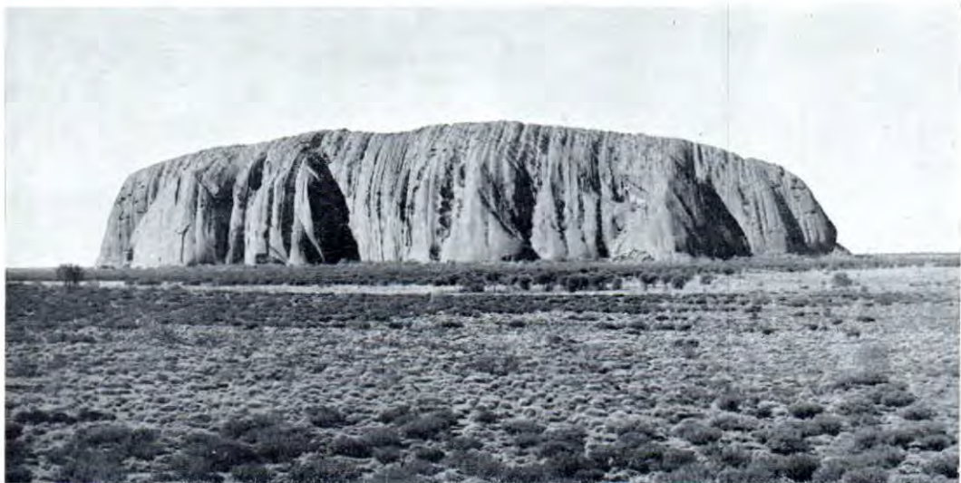
This view of Ayers Rock shows the vertical strata and steeply sloping sides.

Until a few years ago it was an adventure to negotiate the original tortuous and sandy track to Ayers Rock and as a result it had been seen at close hand by a comparatively small number of people. Today, however, air-conditioned coaches, buses, cars and planes carry an ever-increasing number of tourists to visit the great monolith, the vehicles travelling without any great hazards over a well surfaced and graded road. Lodges have been built to accommodate visitors and at present there is a move which will be possibly unsuccessful, because of strong opposition, to install a chair-lift or cable-car to convey non-climbing tourists to its summit.