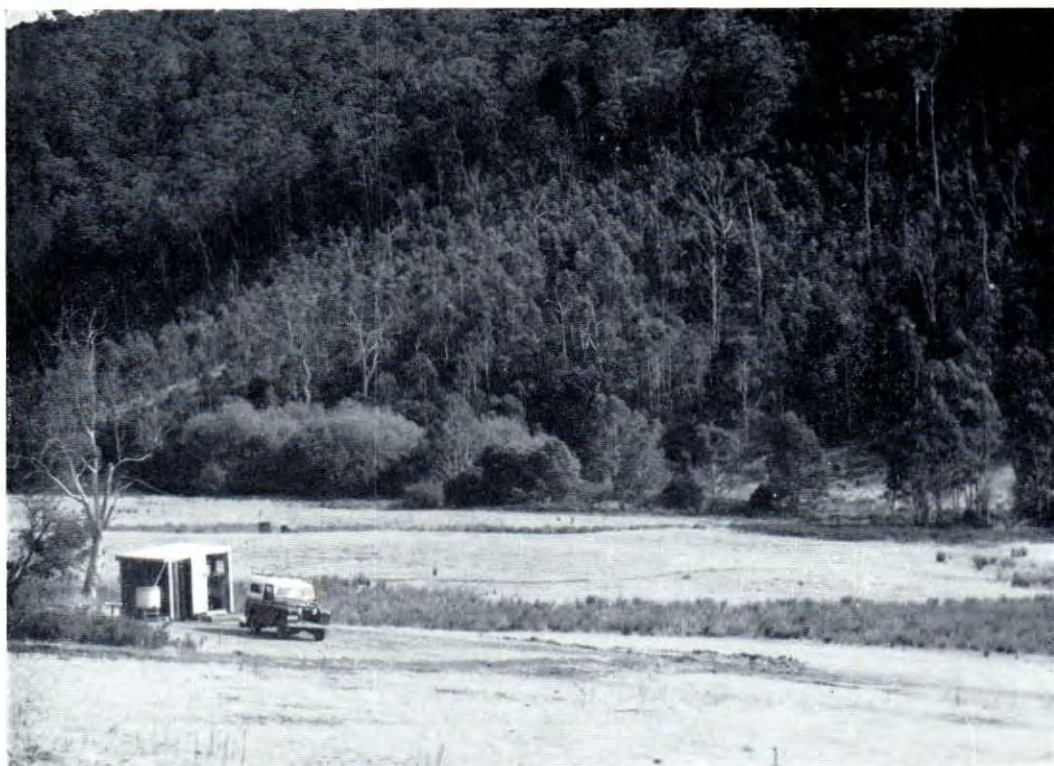
The study area in "The Hunting Grounds," southern Tasmania. Native Hens nest in the marsh in the foreground and by the creek in the middle distance.

shrubs. It always lives within a short distance of water, whether it be lake, creek, marsh or water-hole, even though they may regularly dry up in summer.