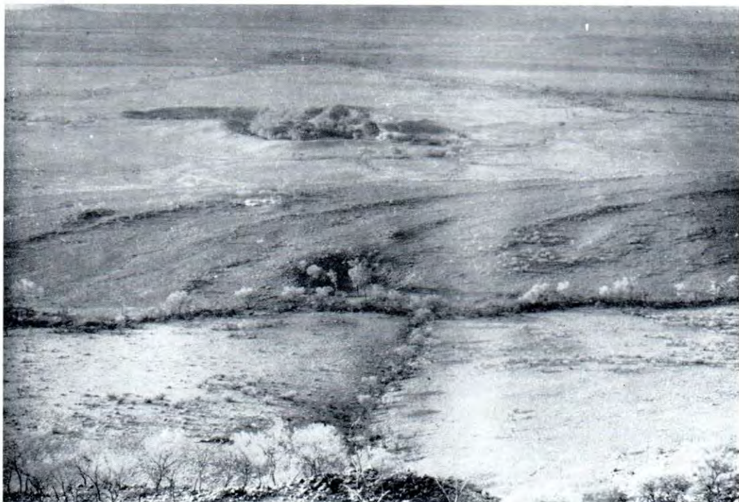
Henbury meteorite craters. The main group of three craters, which are joined together, stands out in the background. Further forward two smaller separate craters are easily seen, one on the bank of a creek and the other behind it.