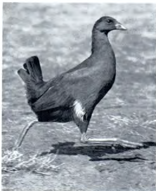
A Tasmanian Native Hen running with its tail cocked in the "alarm" attitude.

Fifteen species of rails occur in Australia, of which six can be described as gallinules—that is to say, rather plump, heavily-built rails with powerful legs and short bills. The Tasmanian Native Hen, Tribonyx mortierii , is a large, dull, greenish-brown gallinule with a white patch on its flank, a greenish-yellow bill, a bright-red eye and thick, very strong legs. Just like