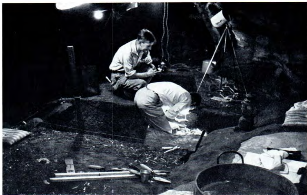
Bones found in the excavation of an Aboriginal rock shelter at Ball's Head are examined by a Sydney University anatomist in the early hours of the morning.