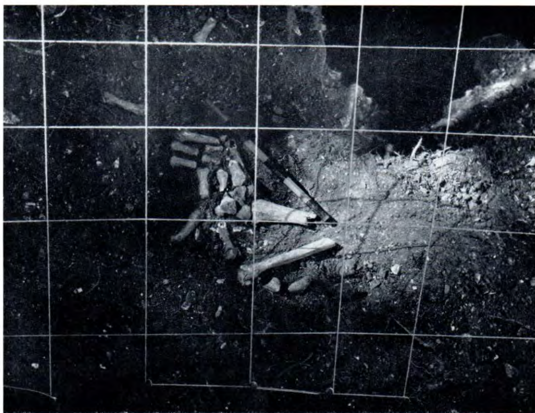
A string grid used as an aid for an artist in recording the position of hand bones.