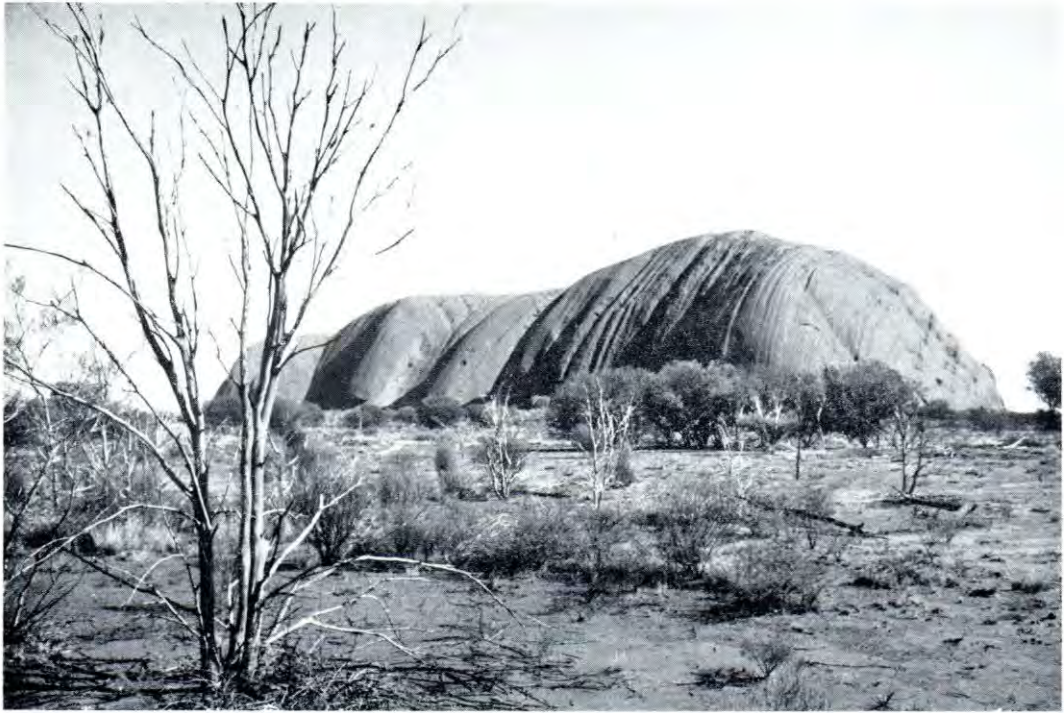
A typical view of Ayers Rock, showing the giant swollen buttresses and vertical erosion gullies.

"I thought I was monarch of all I surveyed and the lord of the fowl and the brute; but lo! a greater than I is here". Giles reluctantly continued his planned journey travelling over the same country already traversed by the Gosse Expedition a few months earlier. No mention was made of Ayers Rock by Giles which must have been visible to him on many occasions during his approach and stay at Mt. Olga.