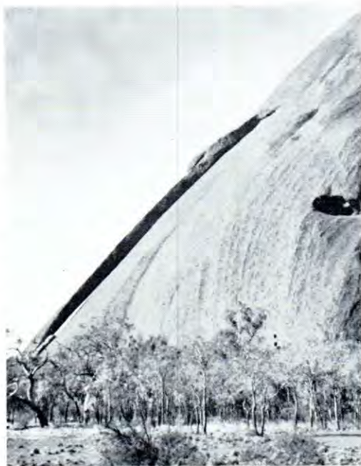
Near the north-western face a curved strip of rock (left), 200 feet long, has been separated from the main rock mass. The resultant crevice, through which daylight can be seen, extends for almost the complete length of the strip.

The explorer Gosse, in 1874, was the first person to record the extraordinary effect of the shedding of rainwater from the great monolith during heavy rain. In his diary on July 31, 1874, he made the following note: