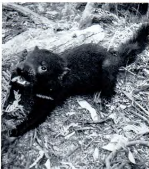
The Tasmanian Devil.

The Tasmanian Devil is a black creature about the size of a cocker spaniel with a very powerful head, jaws and forequarters and having relatively weak hind parts. The strength of the head is one of the most remarkable features of Devils and is reflected in the structure of the skull and jaws. The bones of these structures are all massive, especially those associated with the eating muscles. The teeth also are very strong. The powerful jaws are used for crushing bones and devouring prey and can administer a severe bite. Consequently, the Devil is a species which has to be