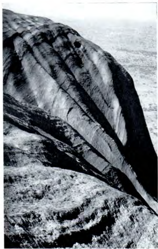
Deeply entrenched erosion gullies extending from the summit on to a vertical face of Ayers Rock.

The extreme changes in temperature between night and day which are experienced in central Australia have resulted in the spalling or exfoliation of the outer surface