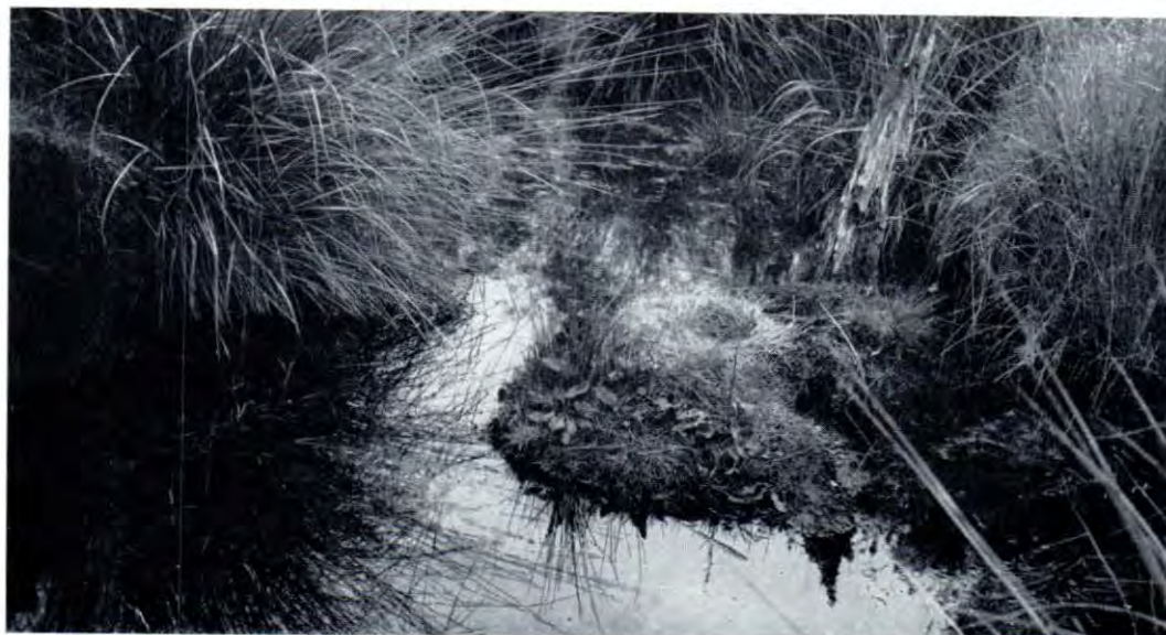
A nursery nest to which Native Hens take their chicks at night to brood them.

Breeding starts between July and September. The onset and end of breeding seem to be determined by rainfall, probably through its effect on the growth of food, and this has a big effect on the production of young, as one brood is produced in a dry and two in a wet year. As well as a well-concealed nest for the eggs beneath vegetation near water, "nursery" nests are built